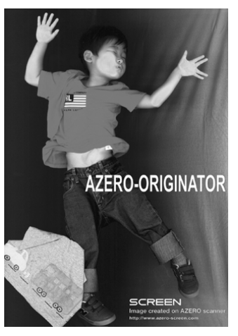
Figure 2. Human subjects

Scanning people has become a popular use for the oversize high-precision vertical scanner/copier. People interested in being scanned simply fill out a form providing information on themselves and the desired output format (text to be included, and so on). After they are scanned, and before the scan is output, they can check the scan results. Once they have OK'd the scan results, the scan is output. The subject can then either take the output home or have it shipped to them. Vertical scanning of a person takes about 45 seconds; horizontal scanning takes about twice as long.